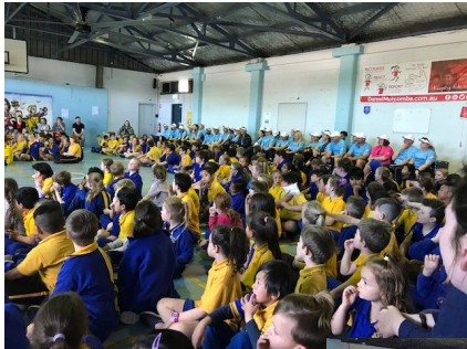
Pictured in pink and light blue at the back of the hall are the 'Tour de Cure' walkers who were having a rest after walking from Mona this morning.

Yesterday we hosted the 'Tour de Cure' walking group who are raising money for Cancer and the SRC presented them with a donation from the school. They hope to raise 13 million dollars across Australia. They gave a presentation to our students, stressing the importance of being fit, eating healthy and being happy — all the same messages we have been hearing through our recent focus on Health Literacy. They then presented us with a surprise — a cheque for $2500 from the Commonwealth Bank towards our health programs in the school. This was certainly unexpected and will be put to good use in the school.